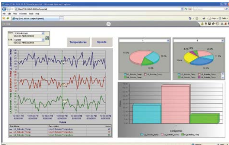
View and analyze critical process data

Different communication methods and drivers are supported for communicating with relational databases. This includes support for communication to ODBC sources, OLEDB